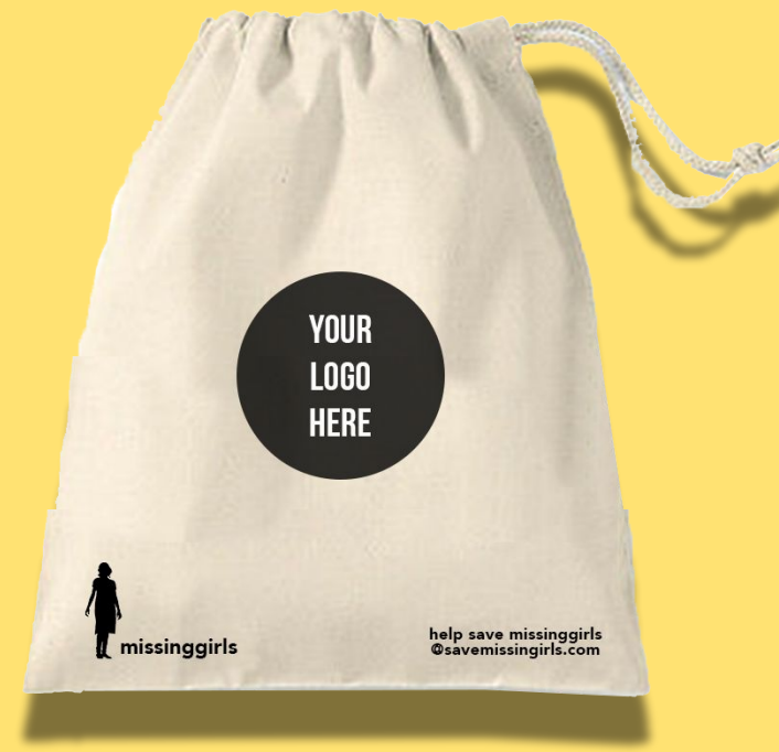
Small Drawstring Bag Dimensions: 13.5" x 11"

Partner with the Trust to help save missing girls.