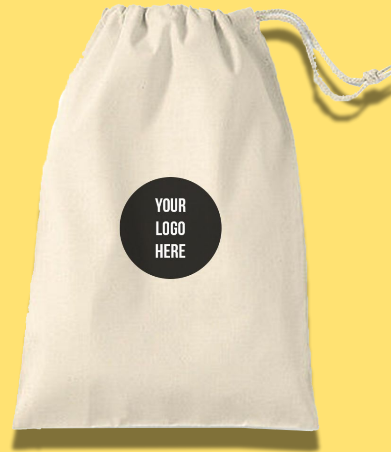
Large drawstring bag Dimensions: 18" x 19.5"