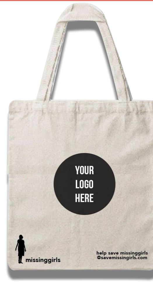
Large Bag with Handles Dimensions: 14" x 16"