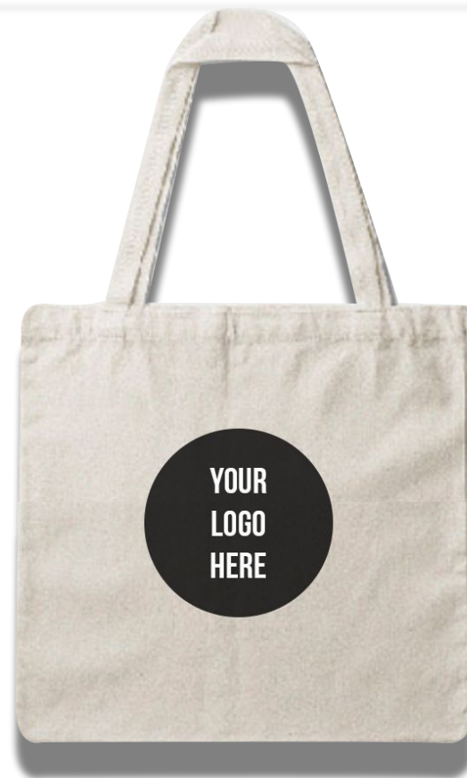
Small Bag with Handles Dimensions: 12" x 14"